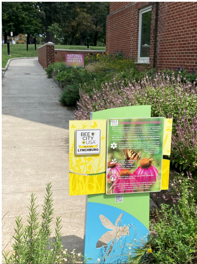
Pollinator Habitat & Signage @ Miller Center