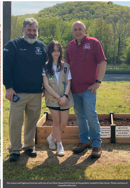
Our town's Social Services Department getting involved by creating their own pollinator garden.