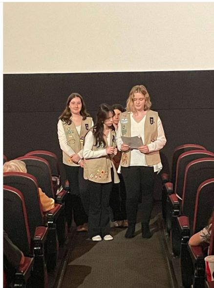
4 local Girl Scouts helped us obtain our Bee City certification as their Silver Award Project. Here they are addressing the crowd at a showing of the movie, The Pollinators at Bank St Theater.