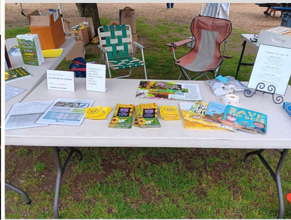
Some of our educational materials set up at New Milford Goat Days.