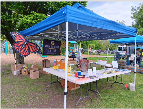
Photo of our booth set up at New Milford Goat Days to educate our public.