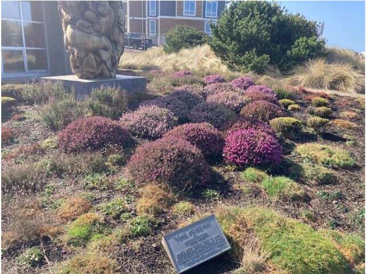
Newport Performing Arts Center Pollinator Habitat, Newport Parks and Recreation Department