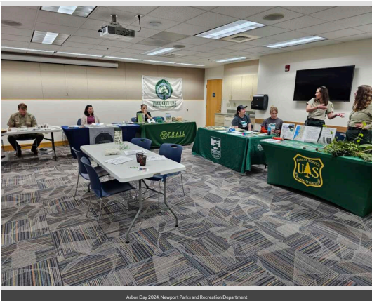
Arbor Day 2024, Newport Parks and Recreation Department