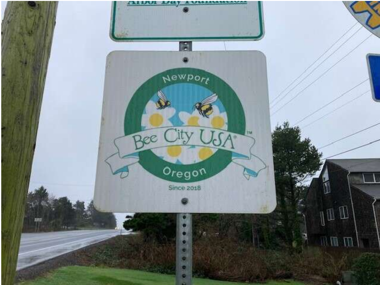
Bee City Sign Coast Highway, Newport Oregon