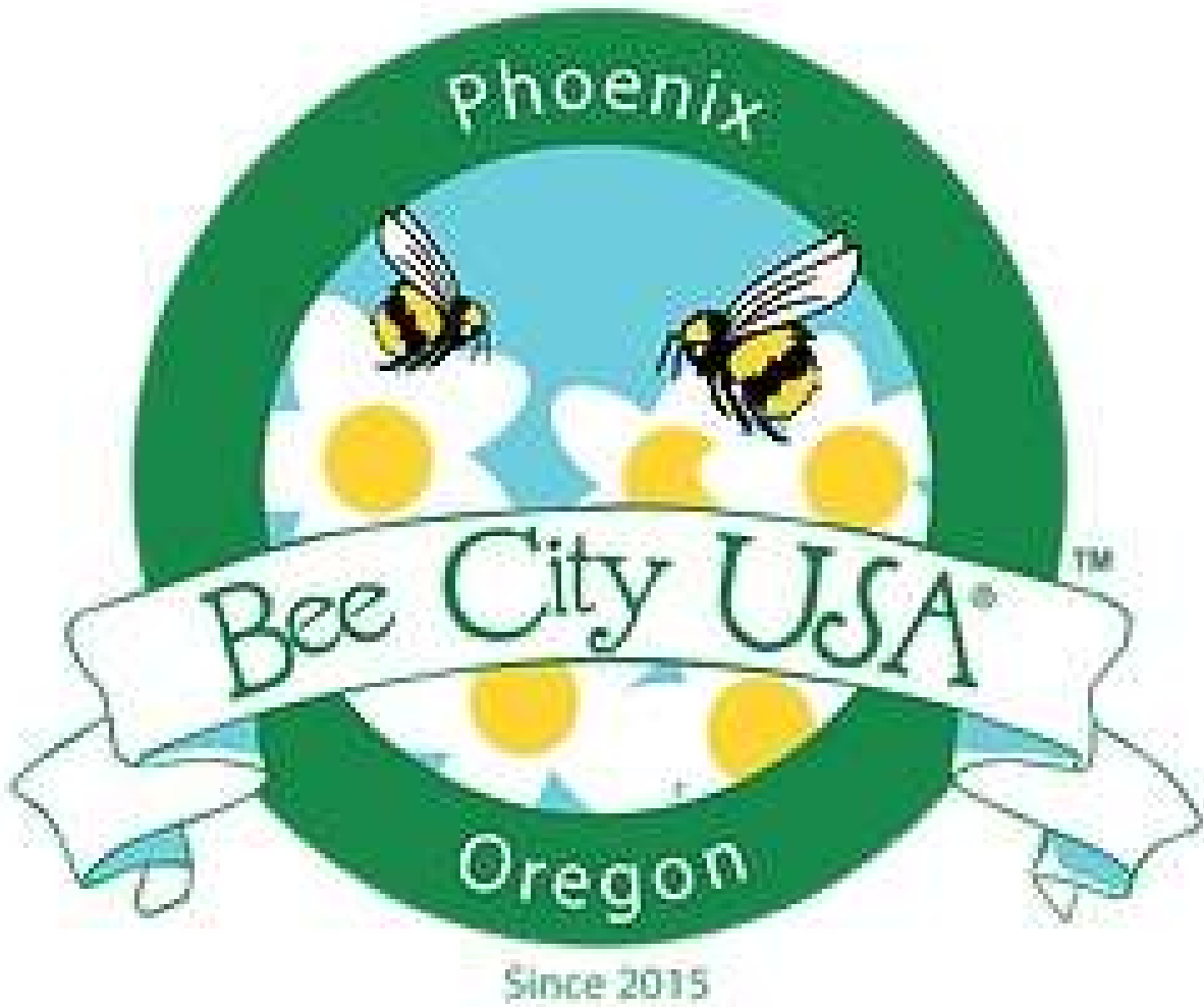
Bee City USA Phoenix logo

Any lessons learned you would like to share? not at this time