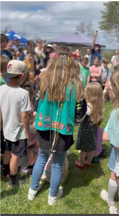
Release of the Doves - Earth Day 2024