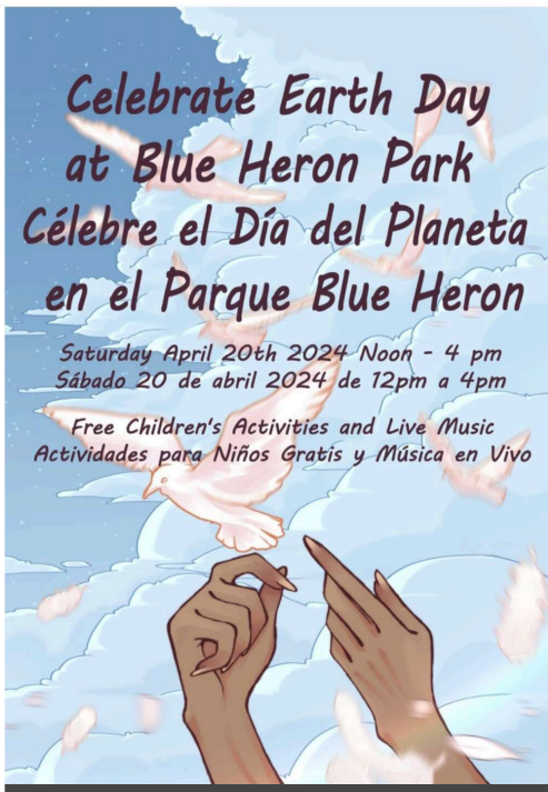
Flyer - Earth Day 2024