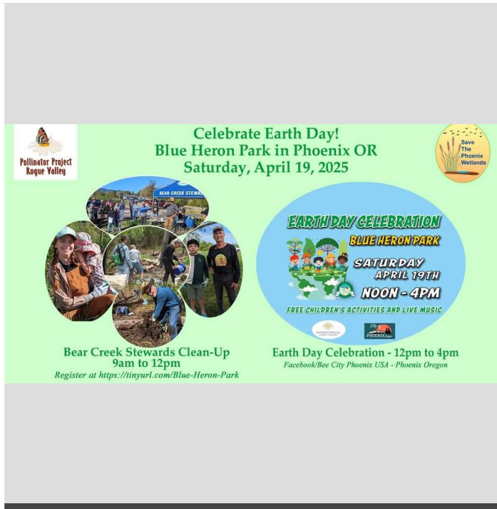
Flyer - Bear Creek Stewards and Bee City USA 2025