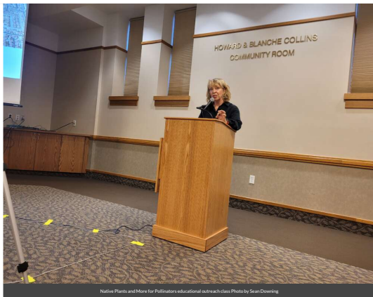
Native Plants and More for Pollinators educational outreach class