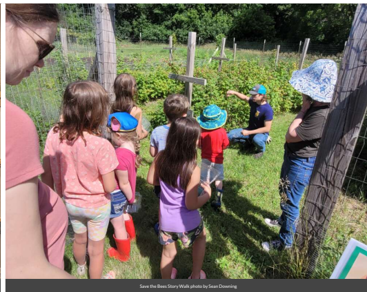
Save the Bees Story Walk