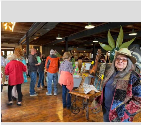
1st Fundraiser at Alma Bsa