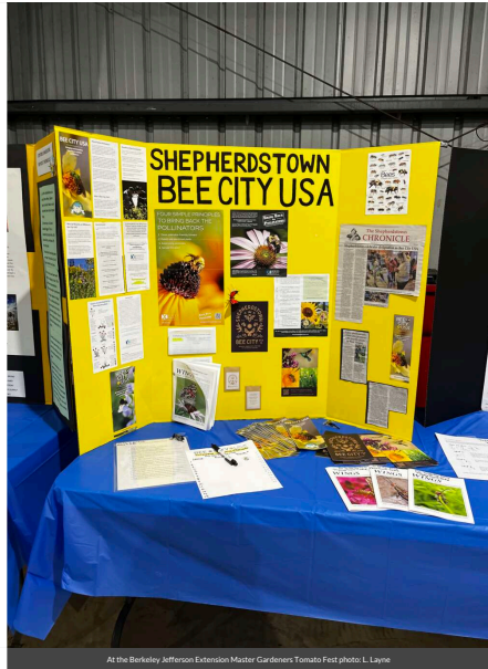
At the Berkeley Jefferson Extension Master Gardeners Tomato Fest