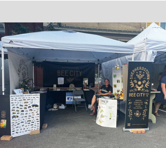
Shepherdstown Street Fest