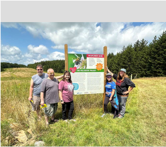
Hikers stopping to enjoy the pollinator garden.