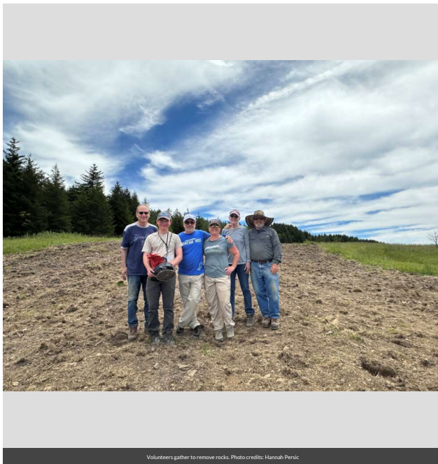
Volunteers gather to remove rocks.