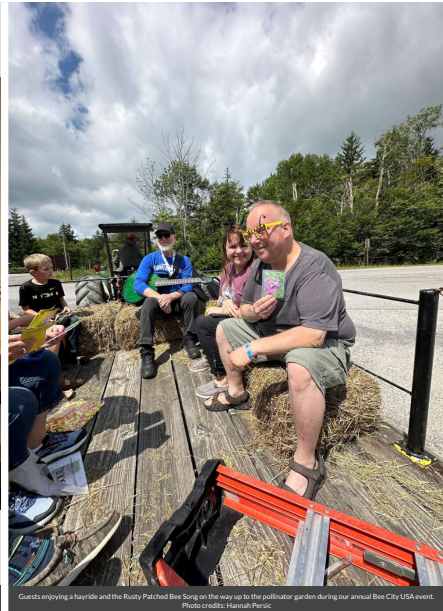
Guests enjoying a hayride and the Rusty Patched Bee Song on the way up to the pollinator garden during our annual Bee City USA event.