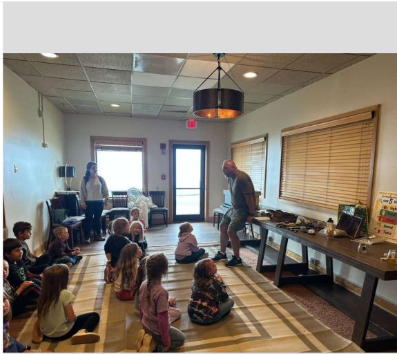
Nature's Mountain Classroom Beekeeping event.