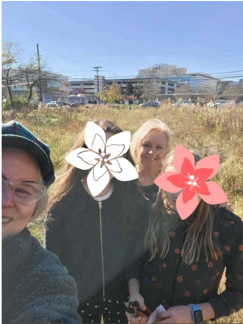
Collecting native pollinator seeds in the Meadow to giveaway later!