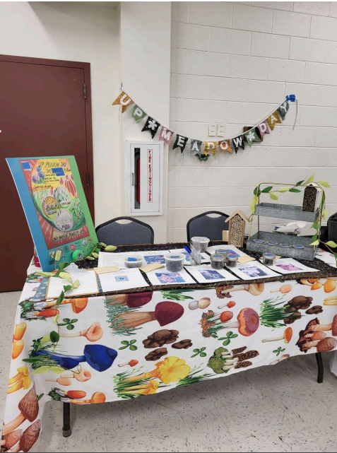
UP Meadow Day shares native seeds at Seed Swap at the Mount Rainier Nature Center.