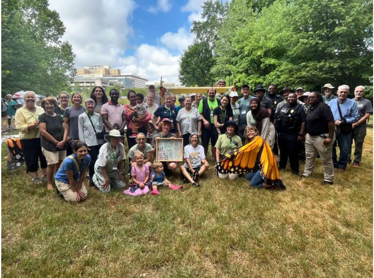
UP Meadow Day's committee!