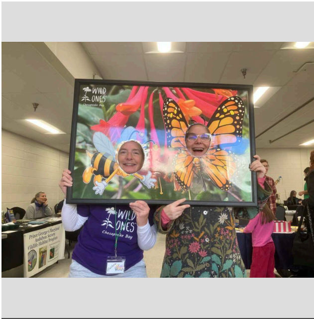
UP Meadow Day and Wild Ones team up for fun!