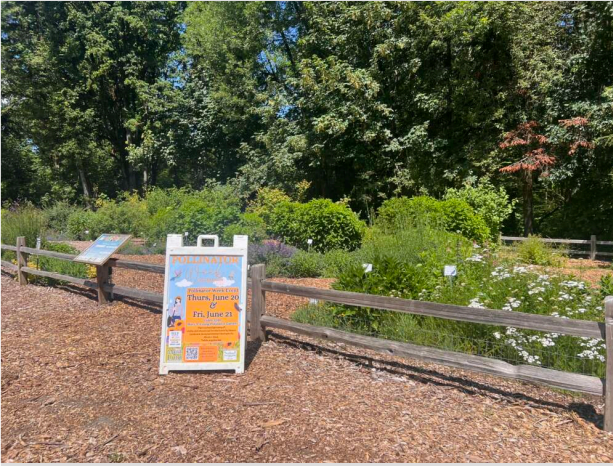
Pollinator Week Promo-Allissa Caceres