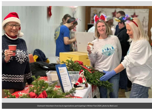
Outreach Volunteers from local organizations participating in Winter Fest 2024