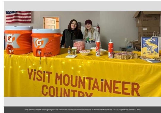
Visit Mountaineer County giving out hot chocolate and Honey Trail information at Westover WinterFest 12/15/24