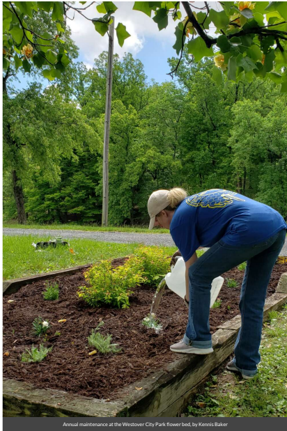
Annual maintenance at the Westover City Park flower bed